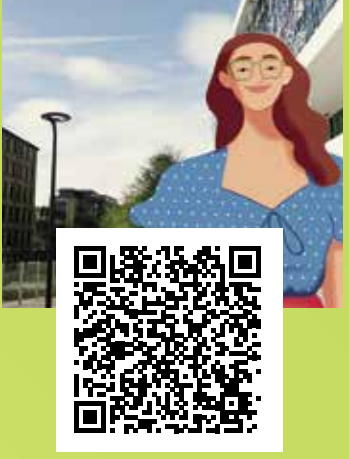
Scan here for more information about Tyra